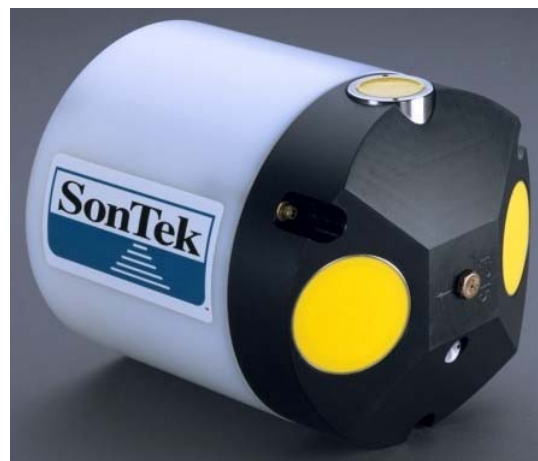
Figure 1. SonTek Argonaut™ SL Doppler Flow Meter

The Argonaut SL is designed for side-looking operation from underwater structures such as channel walls. The Argonaut acoustic sensors, receiver electronics, temperature sensor, pressure sensor and processor are configured in a pressure housing (see Figure 1).