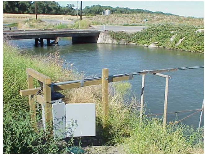
Figure 3. Tisdale Main Canal

Flow discharge was the product of the mean velocity and cross-sectional area (computed from the water level and cross section profile). The flow rate in the canal was computed in post-processing analysis.