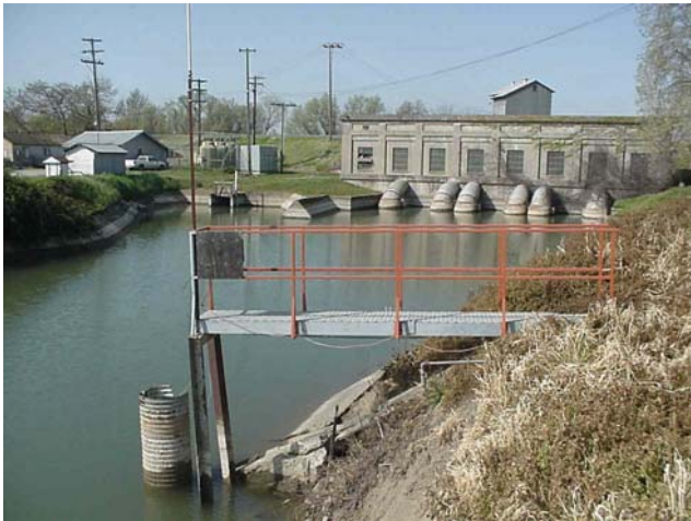
Figure 2. Tisdale Pumping Plant

The Argonaut SL was utilized to measure the daily flow volume from the Tisdale Pumping Plant. The pumping plant supplies water from the Sacramento River to the Tisdale Main Canal (see Figure 2). The average flow rate is 525 cfs.