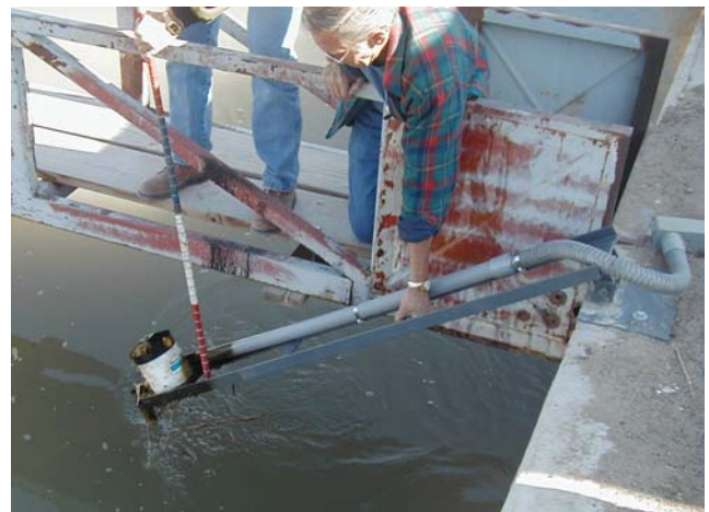
Figure 6. Mounting hardware for Argonaut SL at Truckee-Carson Irrigation District

The user selects the velocity equation used for computing flow and loads the channel geometry with up to 20 cross-sectional points (x-y pairs). The index coefficients for establishing the empirical velocity relationship in the channel are determined through regression analysis. For guidelines refer to Canal Velocity Indexing at Colorado River Indian Tribes (CRIT) Irrigation Project in Parker, Arizona using the SonTek Argonaut SL (Irrigation Association 2003).