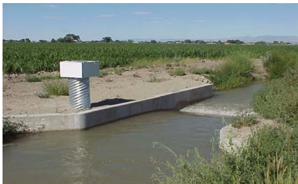
Figure 3. Rectangular Replogle flume with tapered entrance and smooth rounded edges (Truckee-Carson Irrigation District)

Another option is to provide additional side contraction by having vertical walls through the section as shown in Figure 3 (rectangular cross-section).