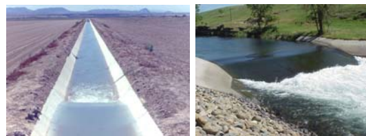
Figure 1. Replogle flumes in irrigation canals

Examples of Replogle flumes are shown in Figure 1 .