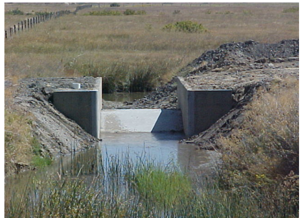
Figure 5. Constructed rectangular Replogle flume

The constructed flume is shown in Figure 5 .