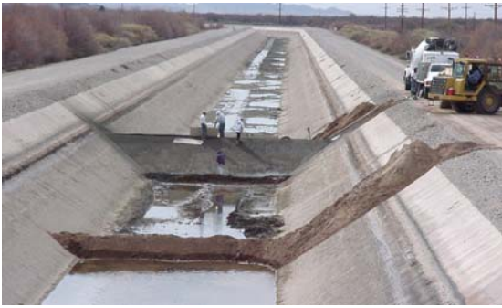
Figure 2. Trapezoidal Replogle flume in existing concrete lined canal

Another option is to provide additional side contraction by having vertical walls through the section as shown in Figure 3 (rectangular cross-section).