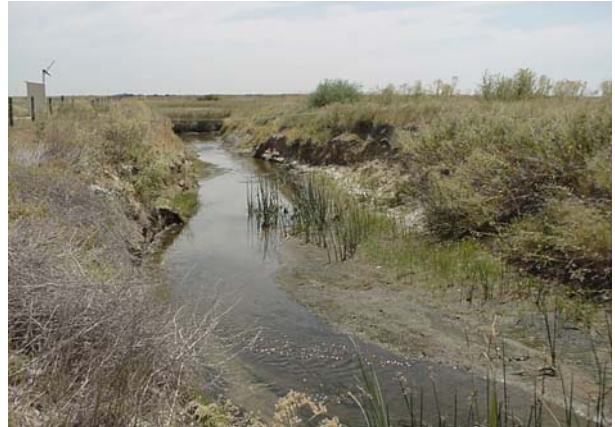
Figure 4. Location for new Replogle flume in an earthen lateral

To illustrate the proper design techniques summarized in this paper, the design for a Replogle flume in a medium-sized, earthen lateral ( Figure 4 ) is described. The minimum and maximum flow rates at this location are 5 and 90 cubic feet per second, respectively.