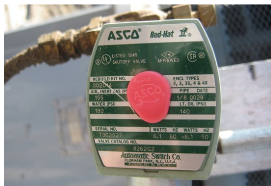
Figure 2. Nameplate for a typical automatic on/off valve for pump oilers

An automatic on/off valve for the oiler is standard in California. An oiler nameplate is seen in Figure 2.