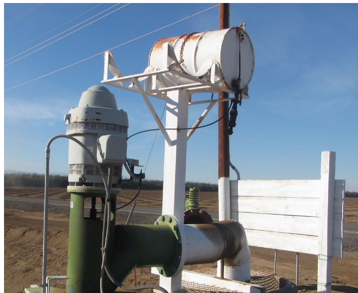
Figure 4. Properly configured oil system

An example installation with good features is seen in Figure 4.