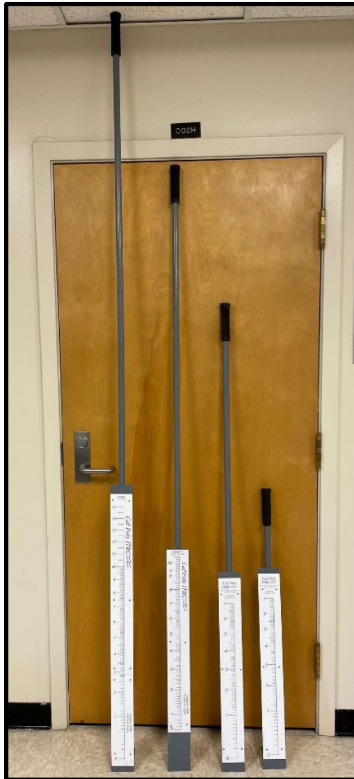
FROM LEFT TO RIGHT: VENTI (8' Handle), GRANDE (6 1/2' Handle), TALL (5' Handle), SHORT (3' Handle)