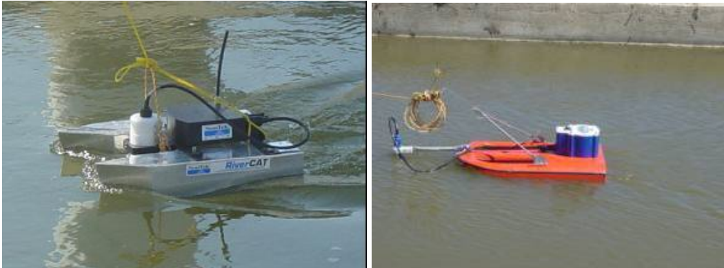
Figure 1. Boat-mounted Acoustic Doppler Profilers collecting flow rate and cross-sectional measurements in irrigation canals